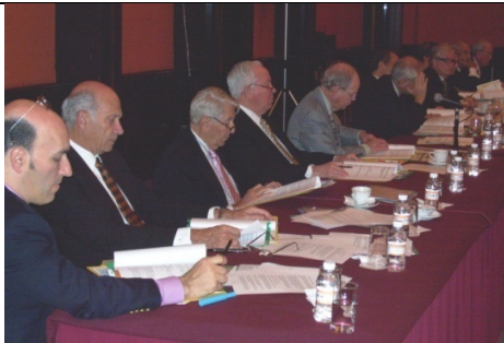
Hardworking Councillors, Mexico