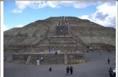
Just one of Mexico's stunning pyramids