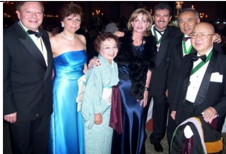
Mexicans welcome Japanese